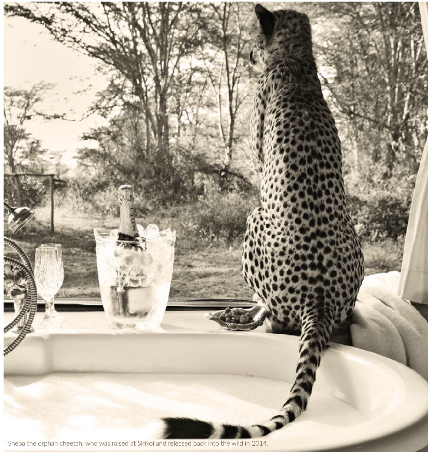
Sheba the orphan cheetah, who was raised at Sirikoi and released back into the wild in 2014.

Jambo Mambo Kwaheri Karibu Safari Njema Habari Asante Asante Sana Tafadhali Lala Salama Mzuri Sana Maji Maradadi Maisha Murefu Ndovu Chui Simba Punda Mulia Nyati Twiga