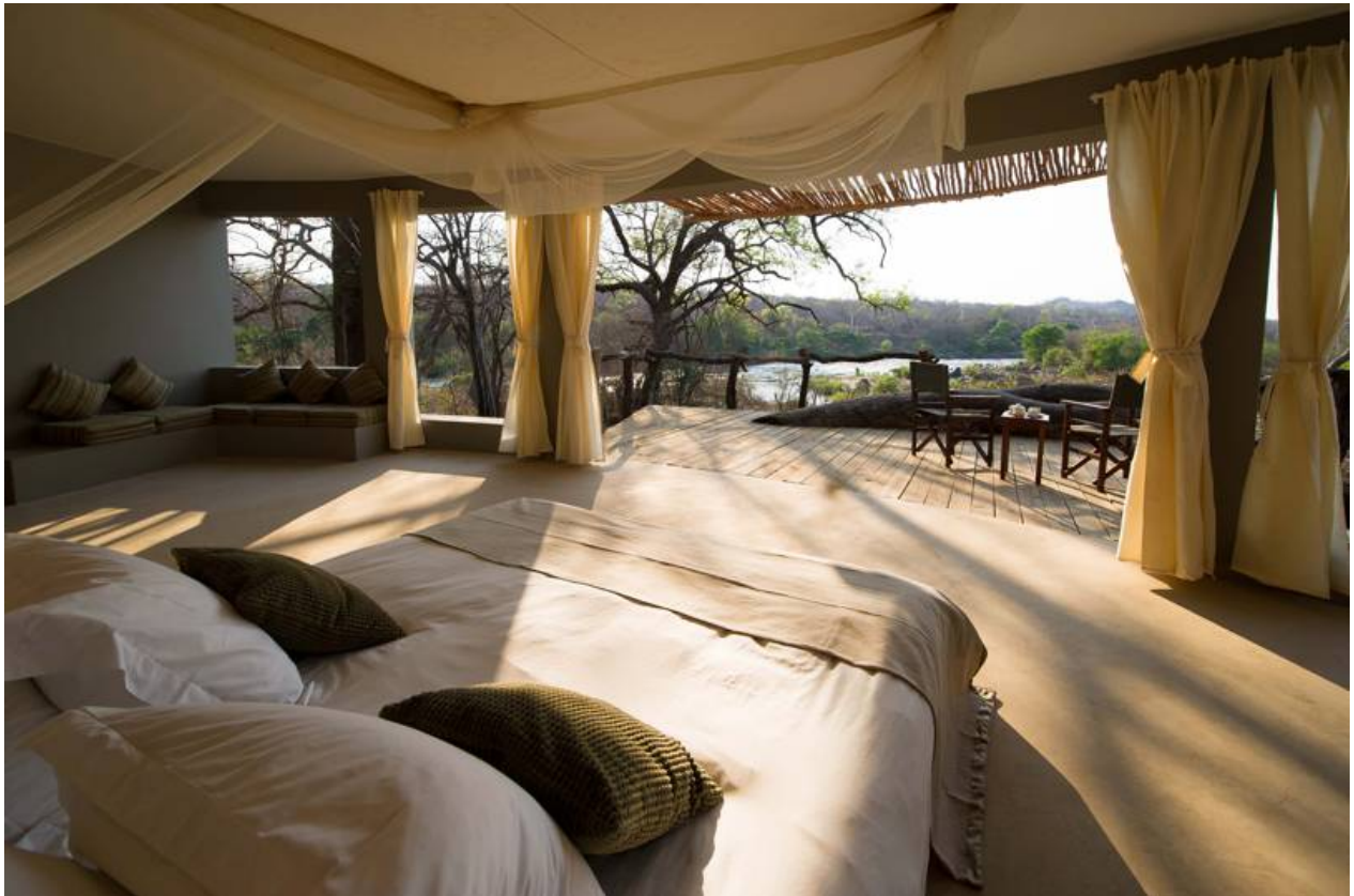
Pictured: the view from inside a chalet at Mkulumadzi Lodge in Majete Wildlife Reserve

African Explorations (01367 850566 www.africanexplorations.com ) offers a nine-day trip to Zambia, staying at Tafika Camp (with one night in Lusaka), from £3,393 per person, full board, including return flights from London, transfers and park fees.