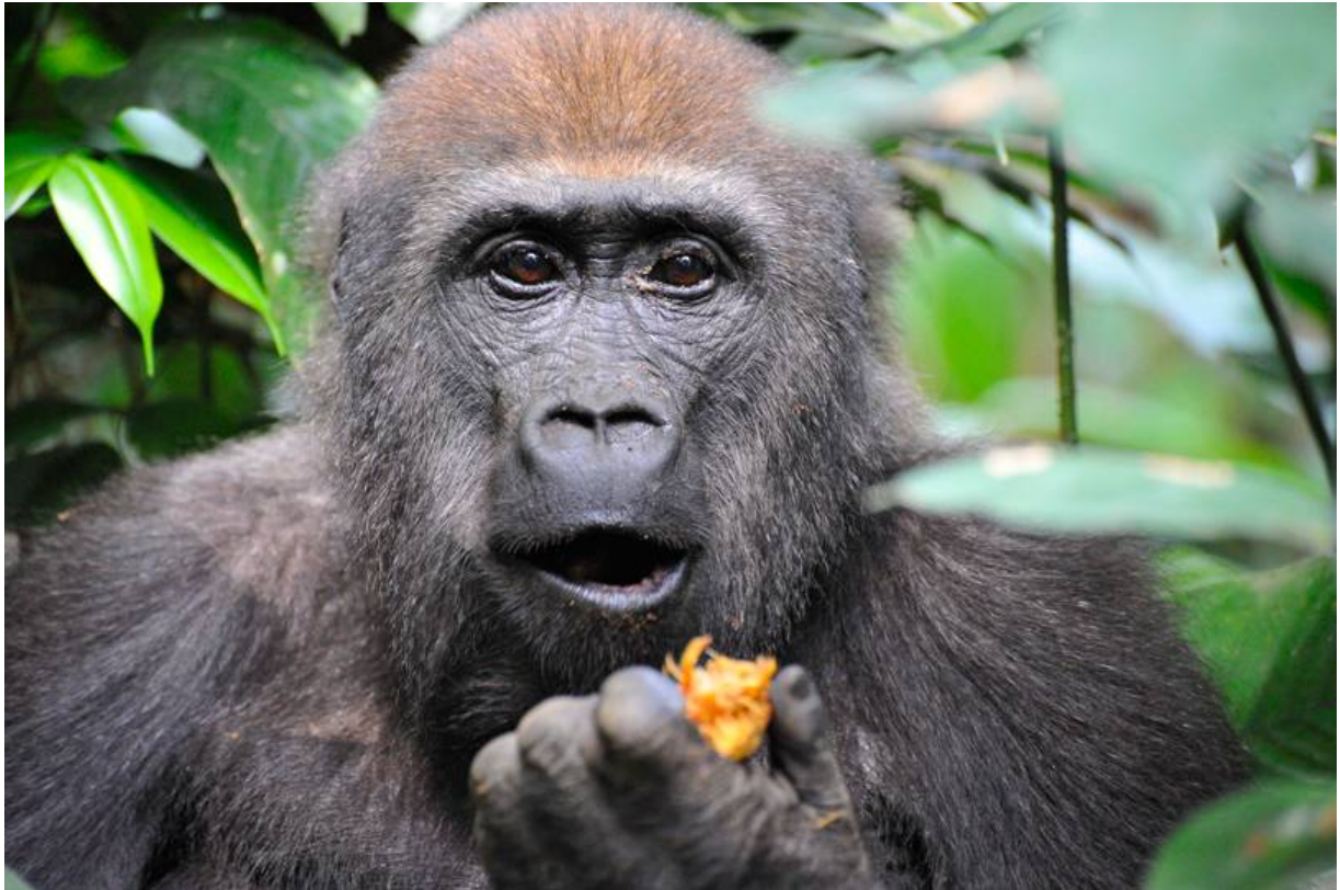
Pictured: a mountain gorilla in the Republic of Congo