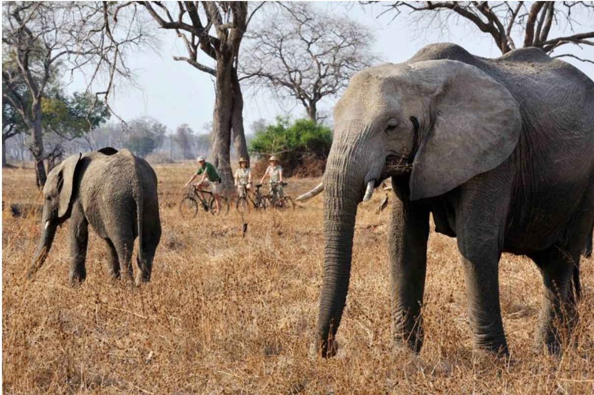
Pictured: mountain-bike safaris from Tafika Camp in the South Luangwa National Park