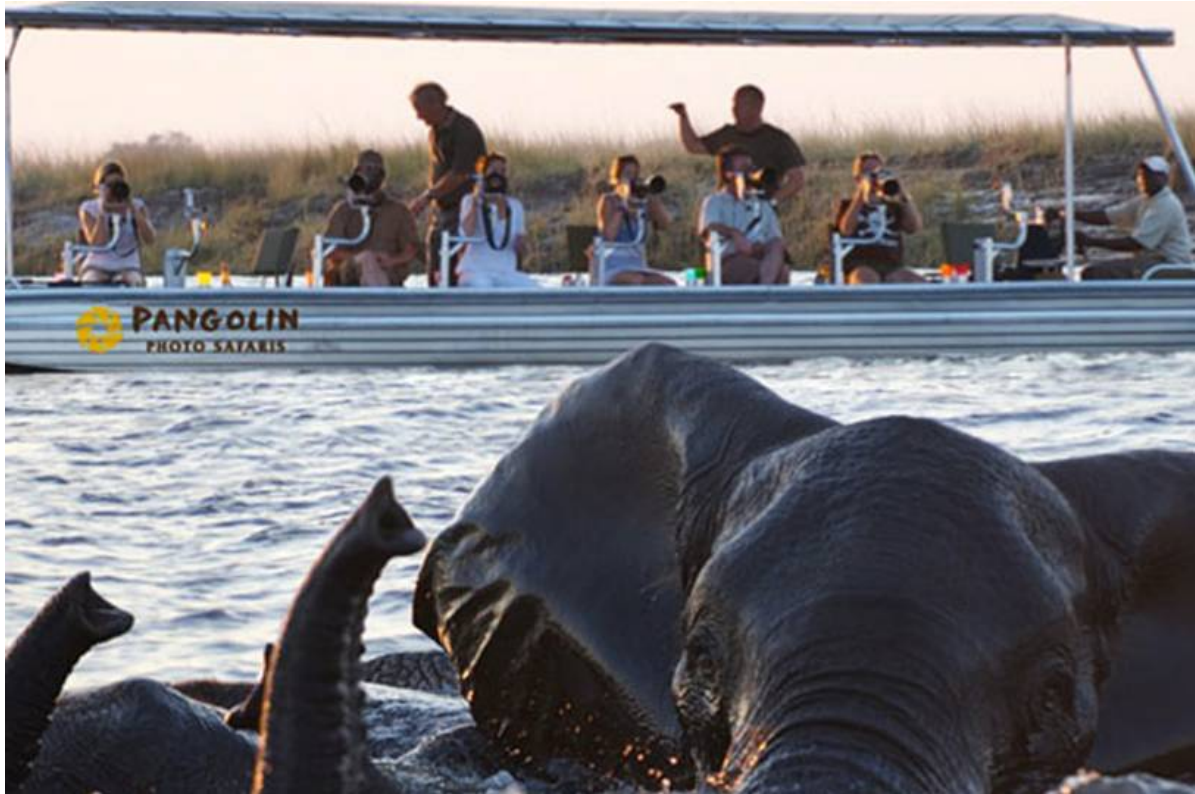
Pictured: a photography session on the Chobe River with Pangolin Photo Safaris

(01367 850566 www.africanexplorations.com ) offers three nights at the lodge from £1,975 per person, full board, including Kenya Airways return flights from Heathrow, airport taxes, transfers, activities and park fees. Rhino tracking costs an additional US$40 per person.