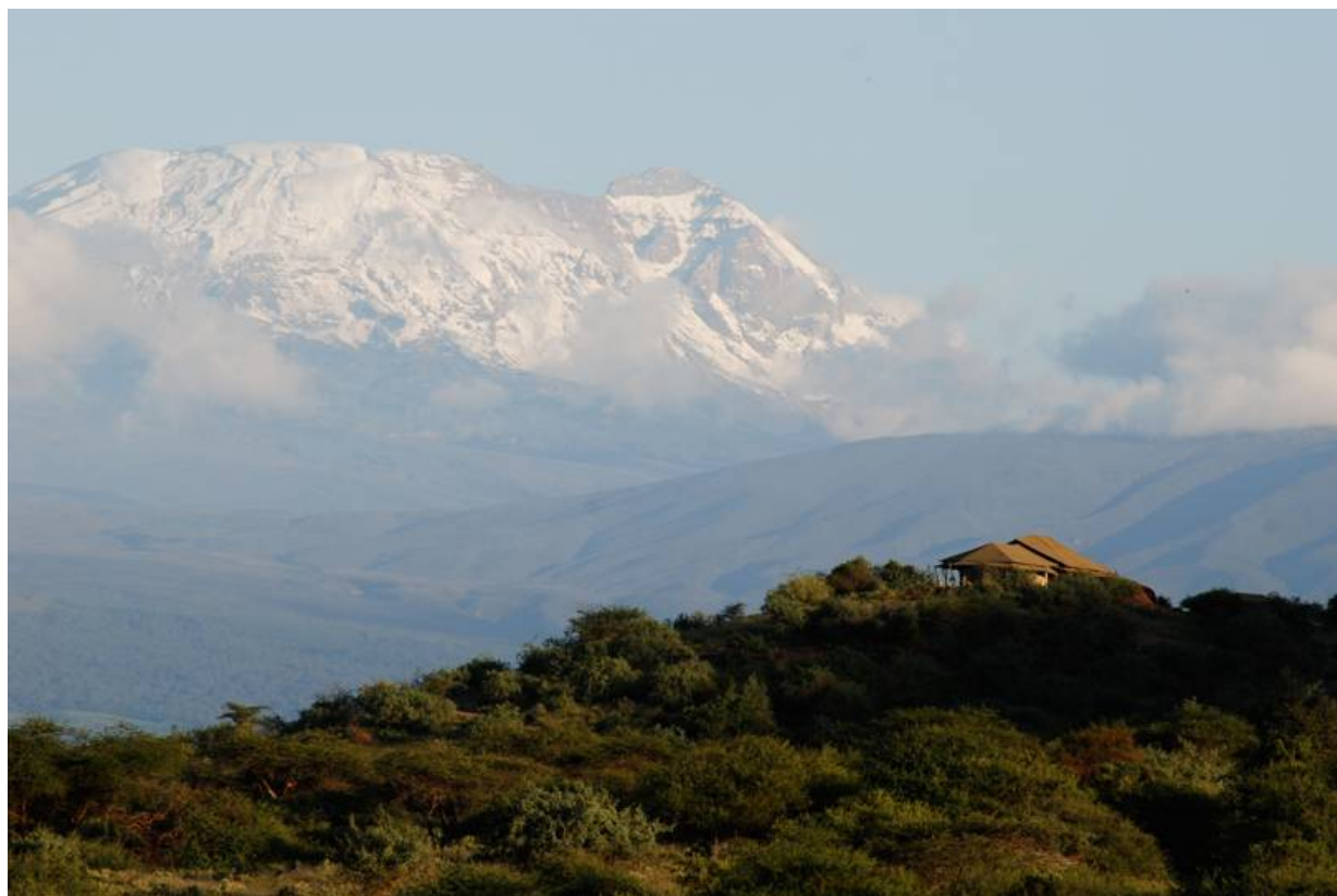
Pictured: Shu'Mata Camp at the foot of Kilimanjaro