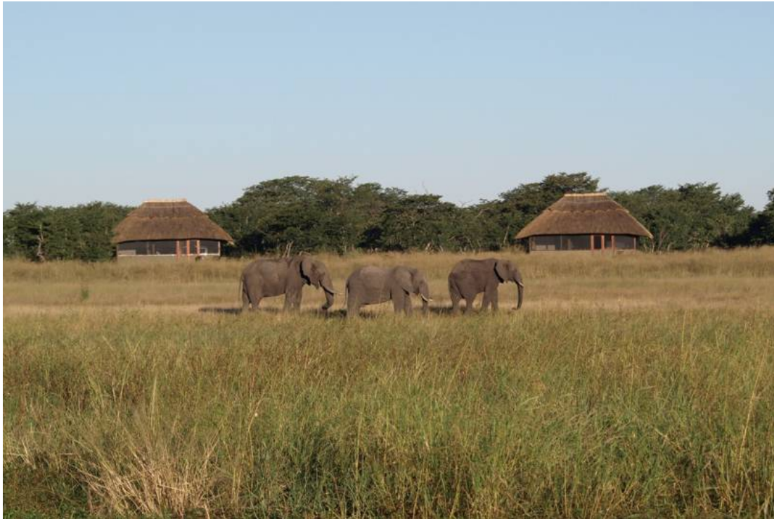
Pictured: the pool at Camp Hwange

you sip your glass of refreshing South African wine under the twinkling night sky. For more information contact African Explorations (01367 850566 www.africanexplorations.com )