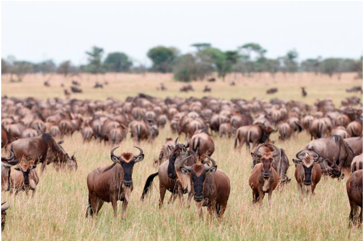
Pictured: tiang antelope migrating in the Sudan

situated beside floodplains in the Moremi Wildlife Reserve, attracts big cats and more than 300 bird species, including the endangered wattled crane, ground hornbill and various eagles African Explorations (01367 850566 www.africanexplorations.com ) offers three nights at Savute Elephant Camp and three nights at Khwai River from £4,985 per person, full board, including British Airways return flights, transfers and all game-viewing activities.