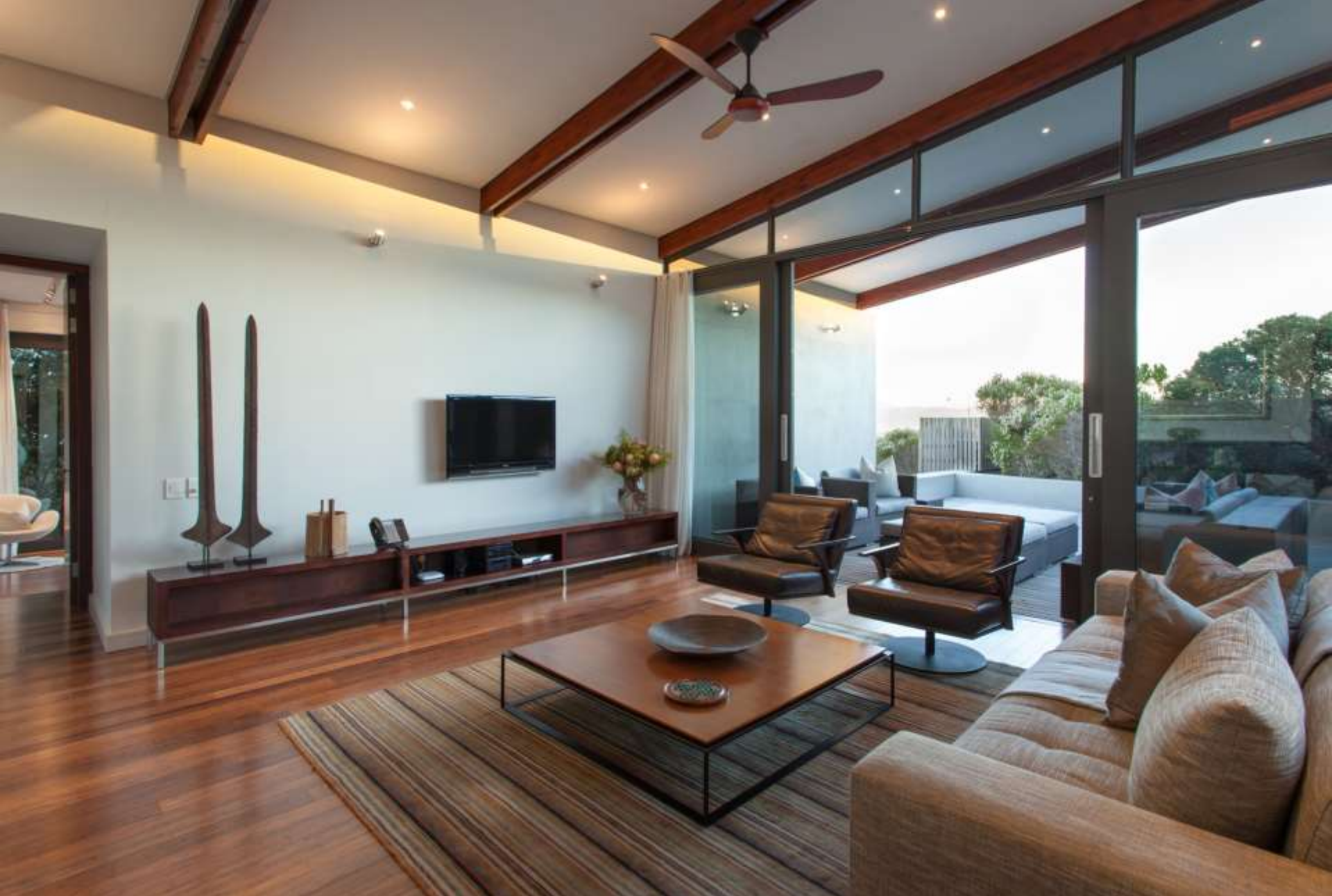
2 nd Master Suite with en-suite bathroom (bath and shower) and lounge - Pincushion