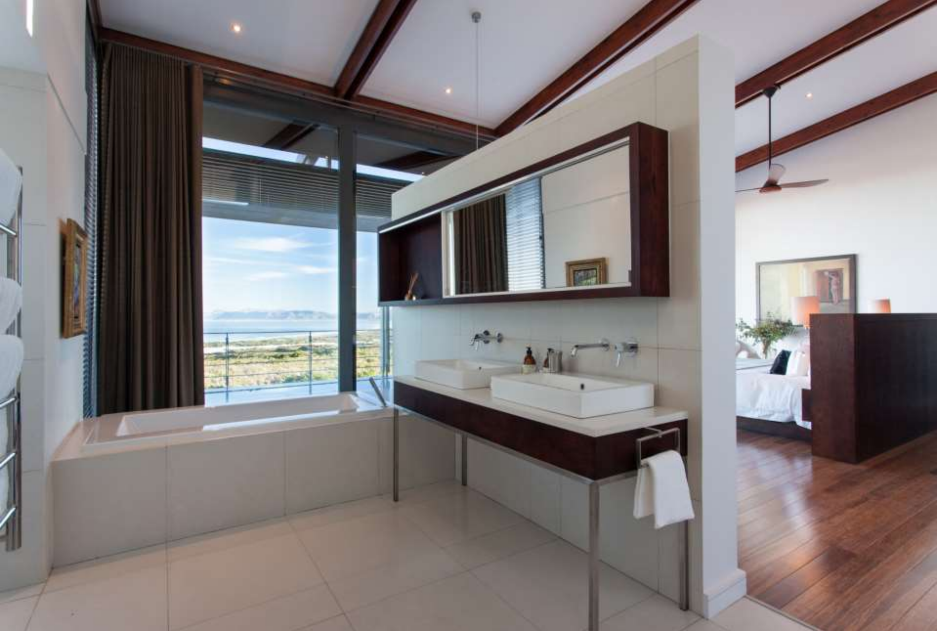
1st Master Suite with en-suite bathroom (bath and shower) - Watsonia