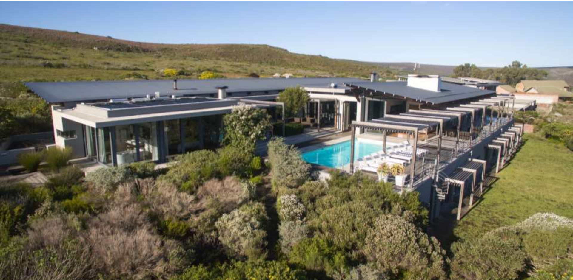
6-Bedroom Grootbos Villa