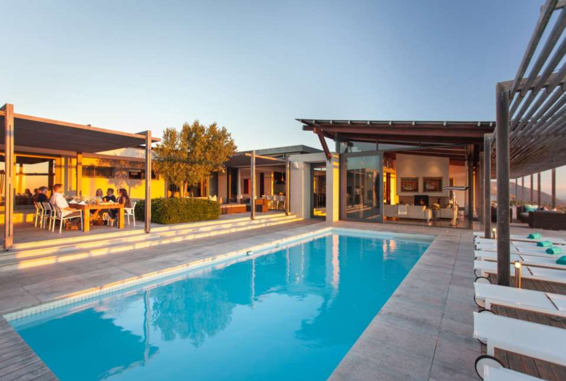
Outside Deck with pool and BBQ area