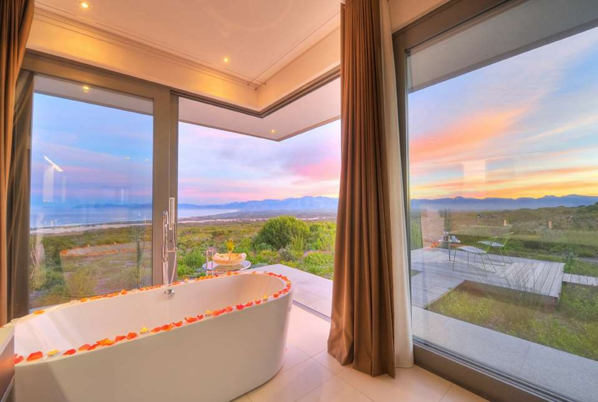
2 nd Master Suite with en-suite bathroom (bath and shower) - Pincushion