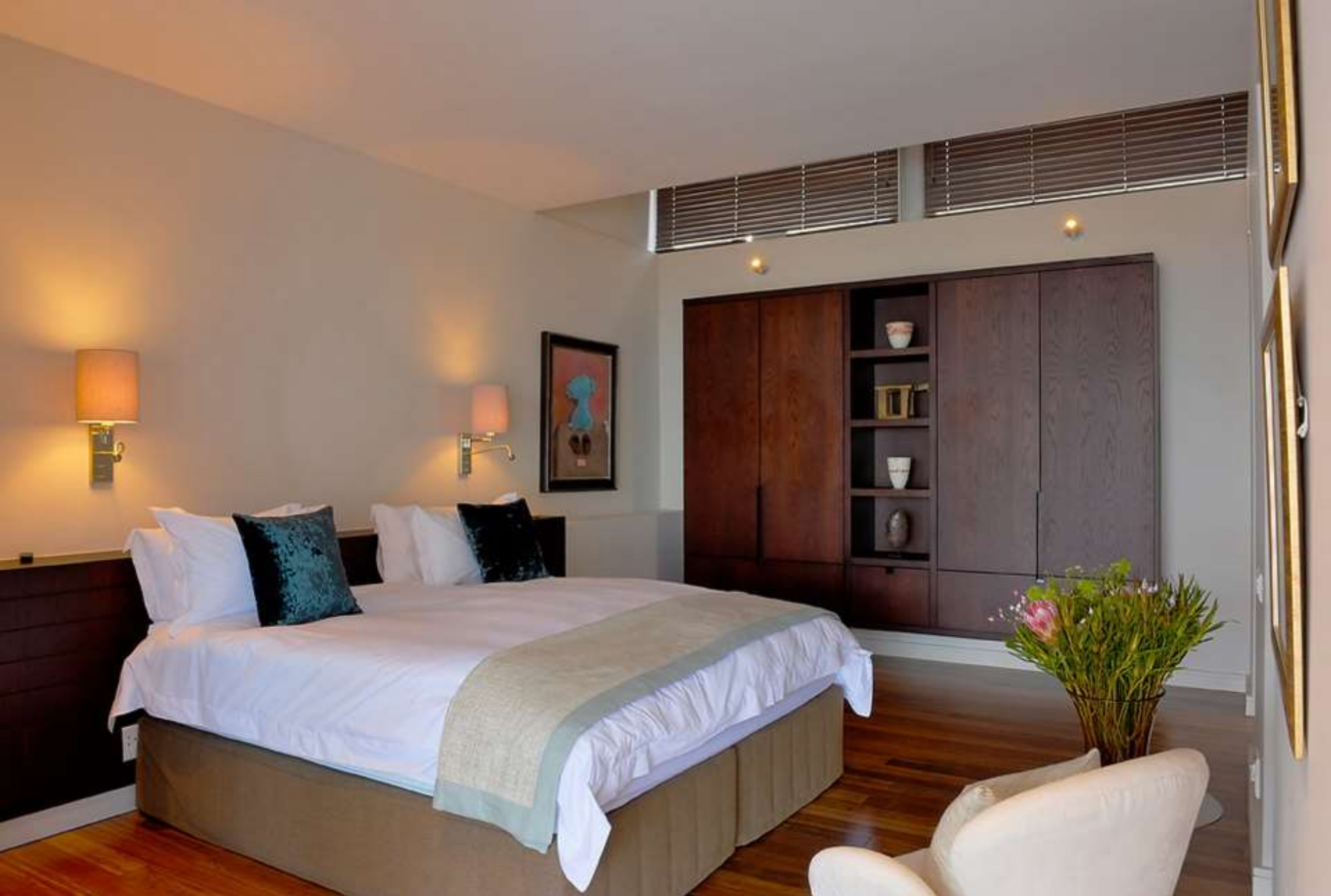
2x Luxury Bedrooms with en-suite bathroom (bath and shower) – Sugar- & Conebush