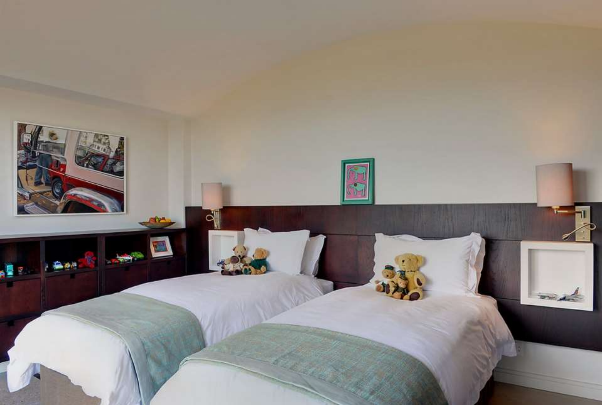
1x Luxury Bedroom with en-suite bathroom (bath and shower) – Cobra Lily