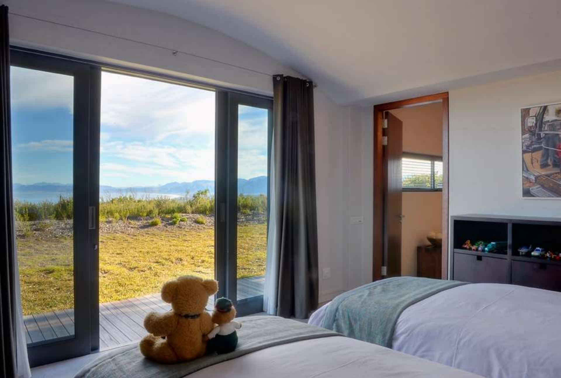
1x Luxury Bedroom with en-suite bathroom (shower only) – Evening Flower