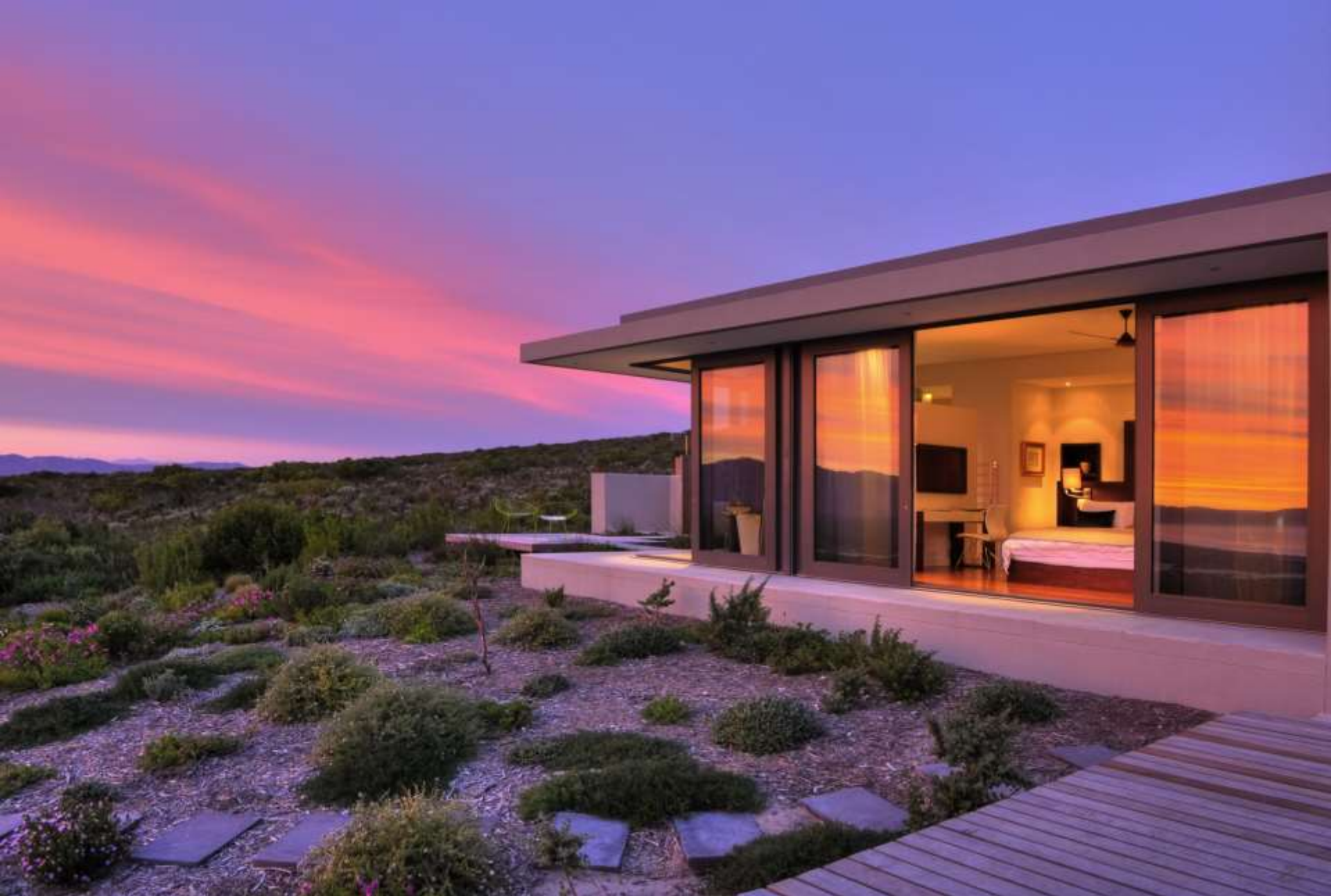
2 nd Master Suite with en-suite bathroom (bath and shower) - Pincushion