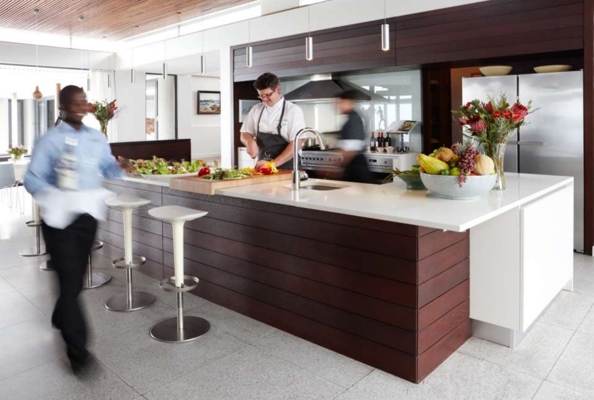
Fully equipped kitchen with storeroom and scullery