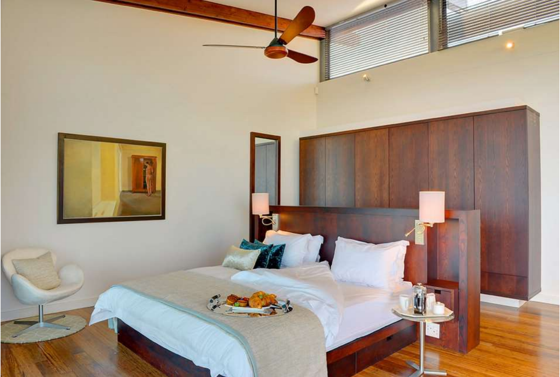
1 st Master Suite with en-suite bathroom (bath and shower) - Watsonia