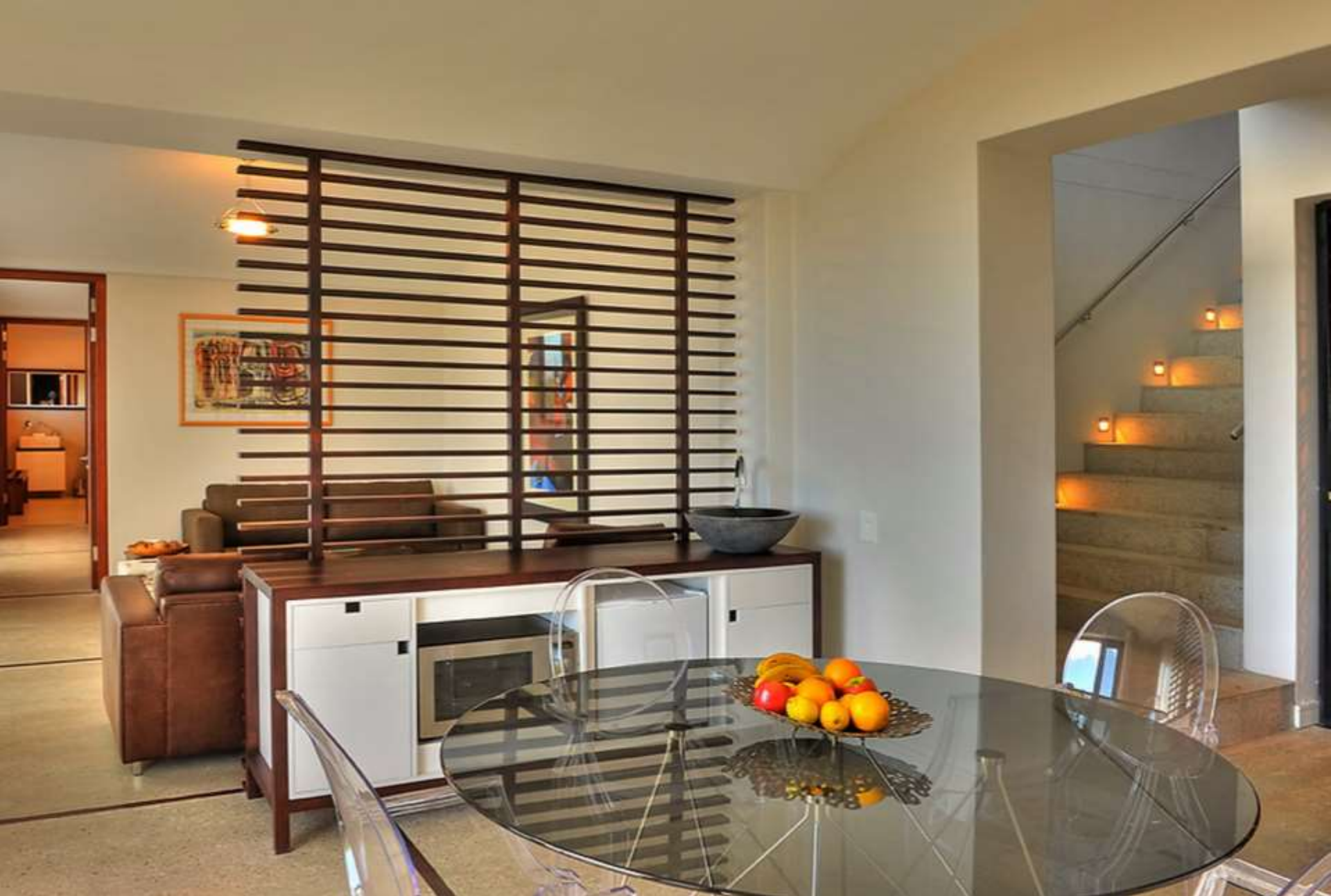
Lounge between Evening Flower & Cobra Lily